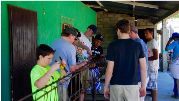
Work at Alpha Omega Church