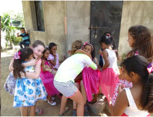
Always having fun with the local kids