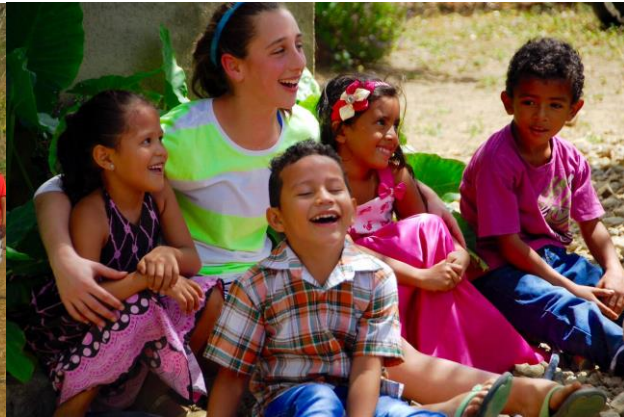
Break time with the locals