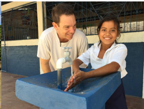
The water finally flows at Cebadilla