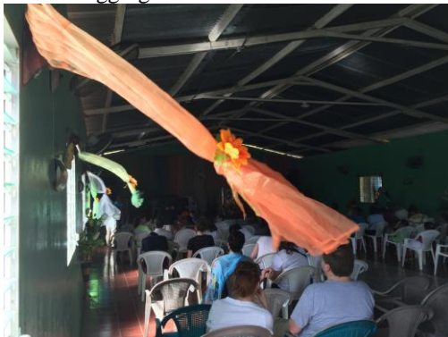
Sharing a service at Alpha Omega Church