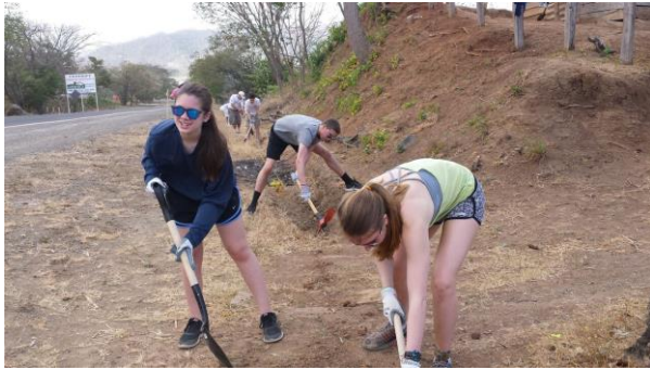
The soil was hard in Cebadilla