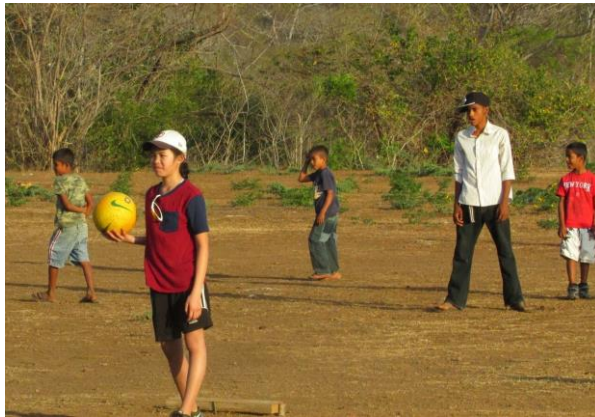
Soccer in Ojachal