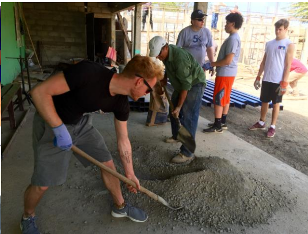
More work at the Alpha Omega Church