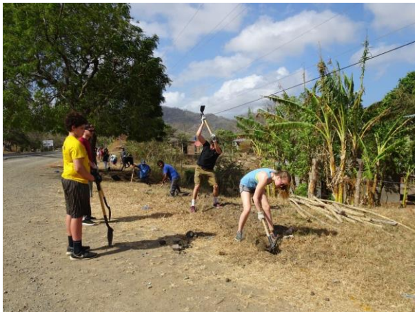
Trench digging at Cebadilla