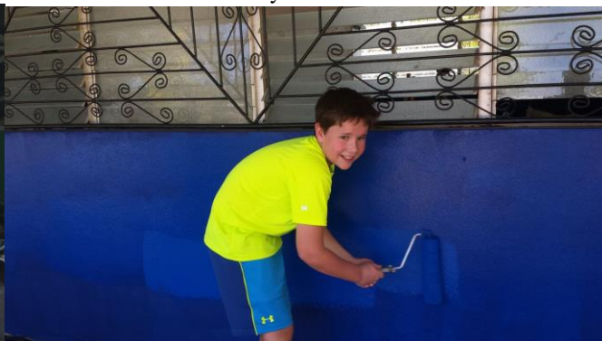
Painting at one of the schools in Las Delicias