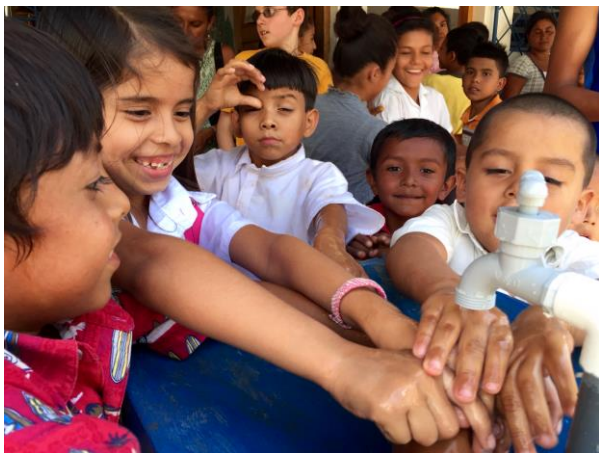
Kids enjoying the new water source at school