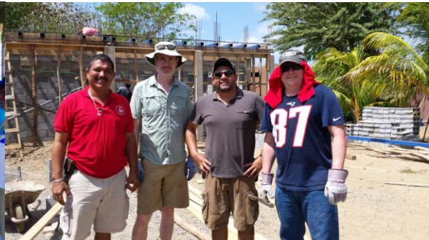
Side by side with our partners